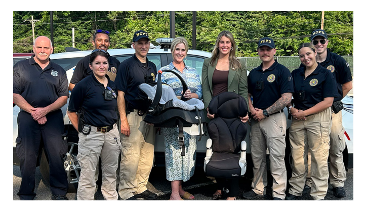
Grenville Baker Boys & Girls Club • 135 Forest Avenue • Locust Valley NY 11560

Twenty community members attended, including representatives from La Fuerza Unida, the EOC of Nassau County, the Charles Evans Center, and the Kiwanis Club of Glen Cove.