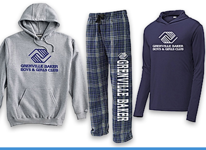
Show Your Support in Style: Shop GBBGC Gear Today!