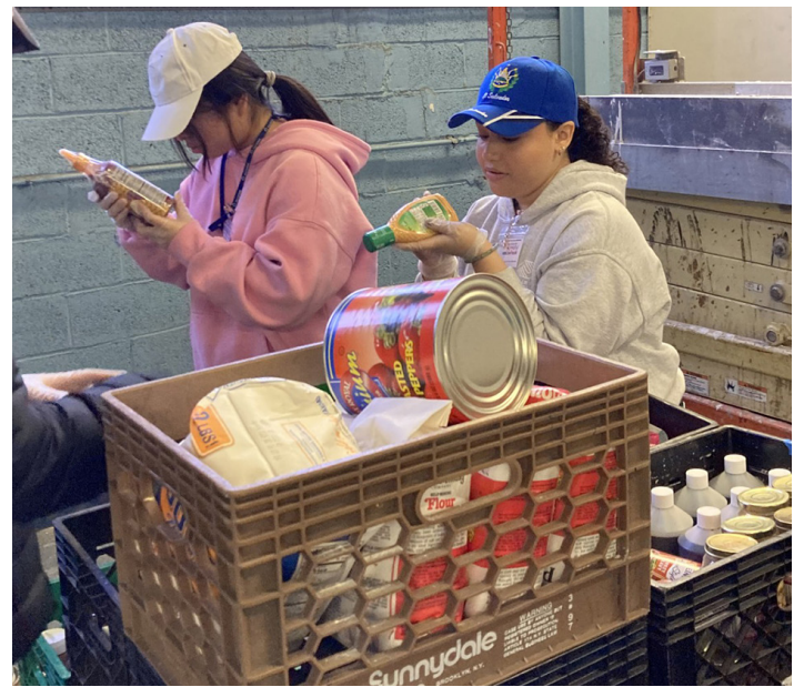
Grenville Baker Boys & Girls Club • 135 Forest Avenue • Locust Valley NY 11560